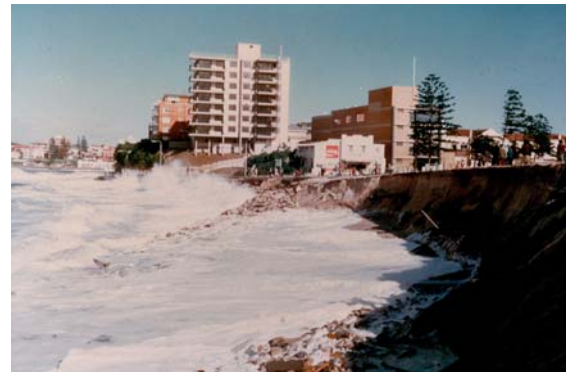
Beach erosion at Cronulla, June 1974

The NSW wave monitoring network is one of the world's most comprehensive wave data sets. Over the years the data has been extensively used in coastal investigations, design and management. More recently near real-time data is available to the community via the internet and is utilised by the Bureau of Meteorology for coastal waters forecasts, storm warnings and verification of computer wave models. In the future the database will provide baseline data to monitor possible changes in the NSW wave climate due to future climatic change.