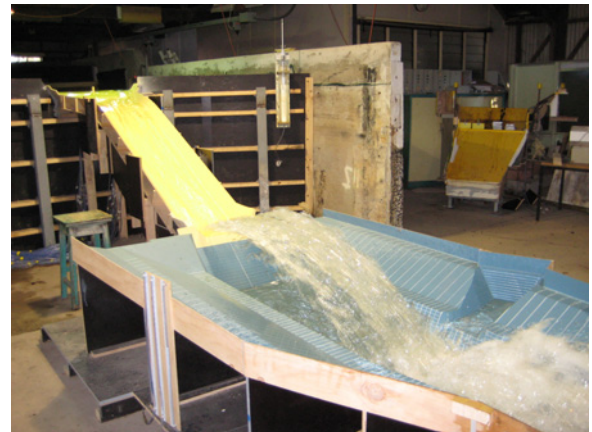
Spillway chute and plunge pool