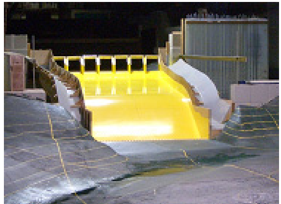
Burrendong Dam spillway 1:85 scale physical model