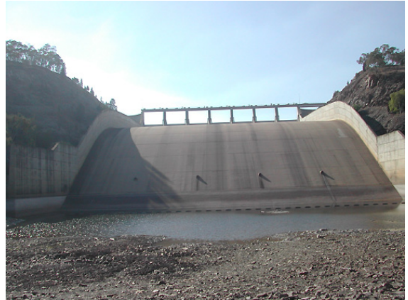
Burrendong Dam spillway looking upstream

The PMF was reassessed and increased from 14,150 m 3 /s to 22,000 m 3 /s. The hydraulic performance of the existing structure was assessed and decisions were made on the strengthening works required to safely pass the revised PMF estimate.