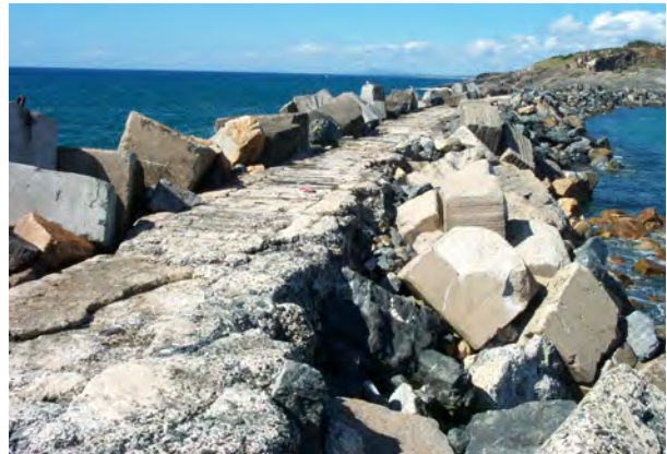
Coffs Harbour eastern breakwater

A comparison was also made between the breakwaters in terms of their relative levels of usage, damage and maintenance required.