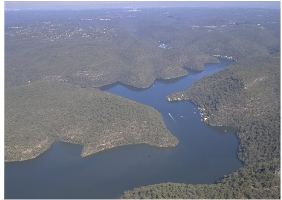
Berowra Creek estuary

The system was developed as a collaborative effort between Manly Hydraulics Laboratory (MHL) and Hornsby Shire Council.