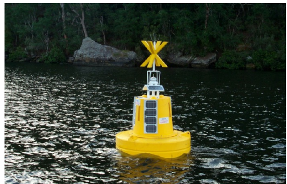
Chlorophyll monitoring buoy

Hornsby Shire Council sought MHL's expertise in real-time data delivery systems to design and install a chlorophyll monitoring system in Berowra Creek. Due to advances in technology it is now possible to monitor chlorophyll levels as an indicator of algal blooms.