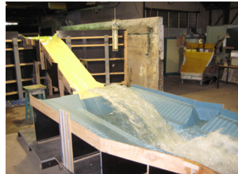
Physical model of a spillway chute plunge pool